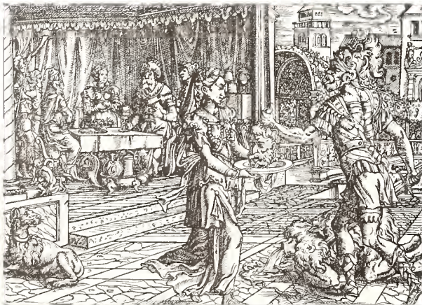
Figure 18. The Feast of Herod , from Biblia , by Jost Amman (1539–1591). Germany, 1570. Woodcut, 10.8 x 15.3. British Library (IA; A181.104, Becker 1 NT 3)